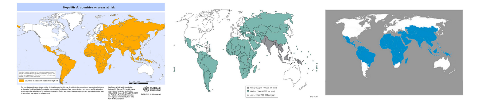
Figure 1: Risk Areas for Hepatitis A<sup>2</sup>, Typhoid Fever<sup>3</sup> and Travelers' Diarrhea<sup>4</sup>

The maps below show risk areas for food and water borne diseases.